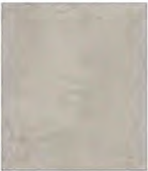
SILK Matte finish with a thin layer of glaze that provides a subtle shine and a nice soft touch. Surface finish that results extremely easy to clean.