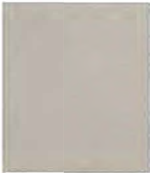
SATIN Completely matte finish, Highly resistant and ideal for commercial applications