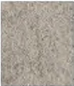
RIVERWASHED Finish with a rough texture and relief that evokes sensations to the touch.